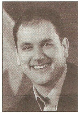
Dan Albas, MP